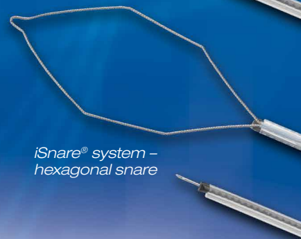
iSnare® system – hexagonal snare