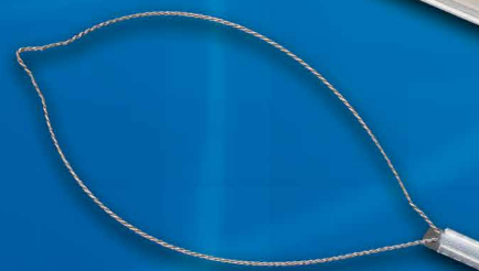
iSnare® system – oval snare